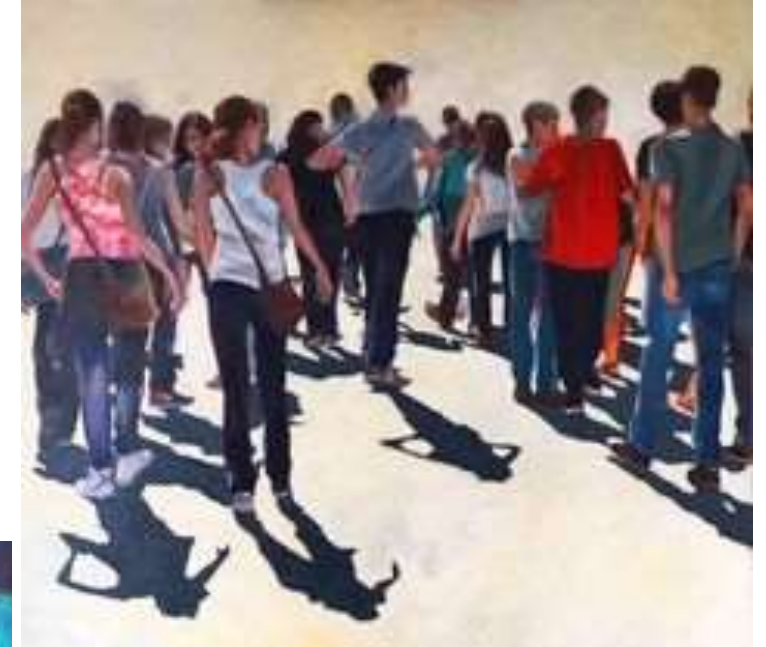
Q1- Ideas for Crowds